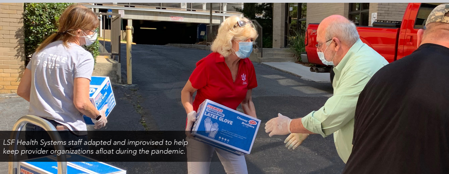
LSF Health Systems staff adapted and improvised to help keep provider organizations afloat during the pandemic.